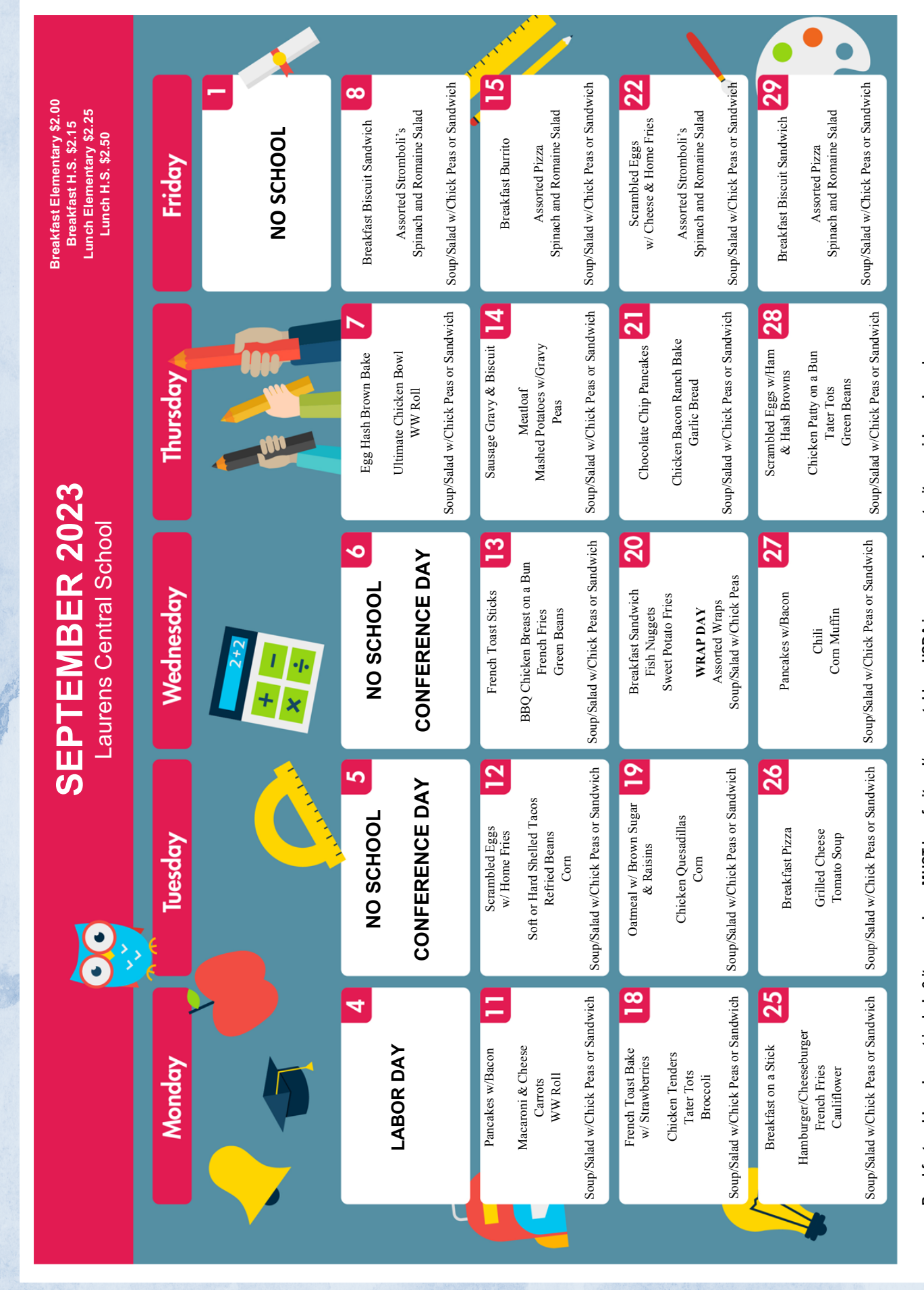
Breakfast and Lunch must include 3 items and one MUST be a fruit and/or vegetable. USDA is an equal opportunity provider and employer